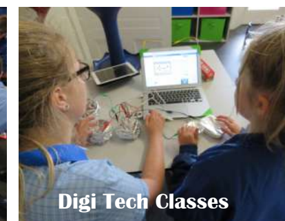
Digi Tech Classes