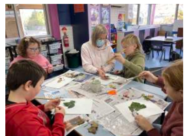
Grade 3 create collages from nature