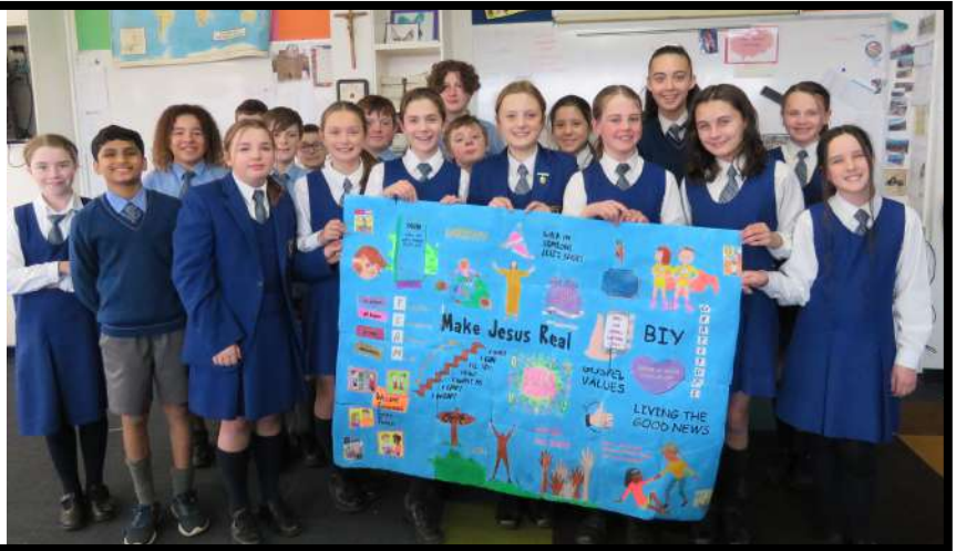
Grade 6 with their MJR poster

A very exciting opportunity for our young band players to meet James Morrison in person.