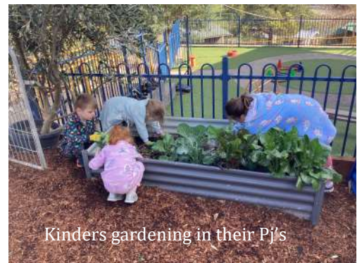
Kinders gardening in their Pj's